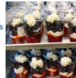
Sakuma Farms berries